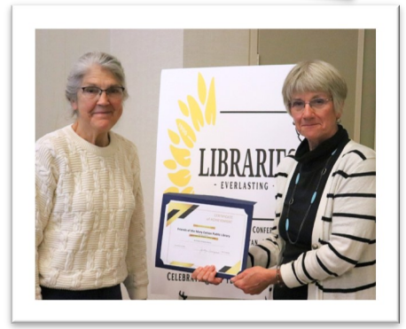
Friends of Mary Cotton Library (Sabetha) - Outstanding Group Award