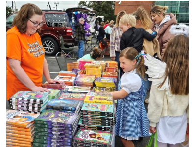
Sharing books in El Dorado

Delaware Township Library - Valley Falls KS - Had a great time at their very first Bunco Fundraiser for the library.