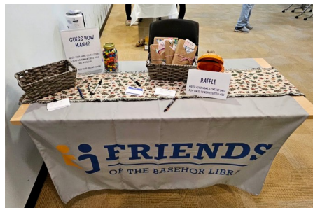
Welcome table at the Basehor Volunteer Appreciation Open House

Friends of Basehor Library - Were honored with a Volunteer Appreciation Open House to celebrate the accomplishments of their active group. Guests enjoyed fruit and pastries, a craft, and raffles, and the volunteers also received a small token from the Library to show their appreciation (see photo, left).