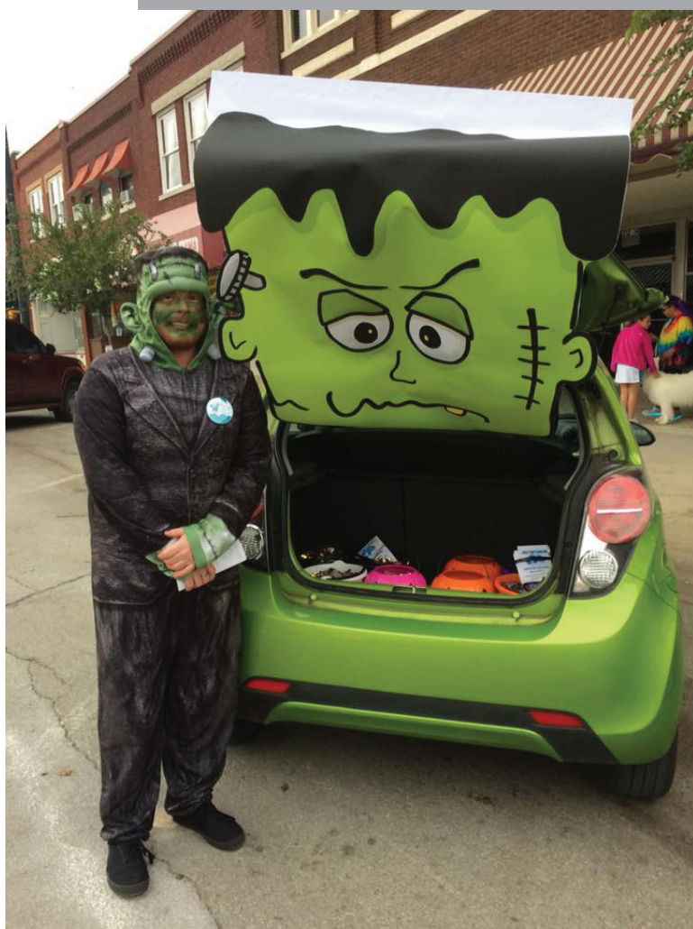
The Friends also provided a chili feed during the Halloween Trunk or Treat.