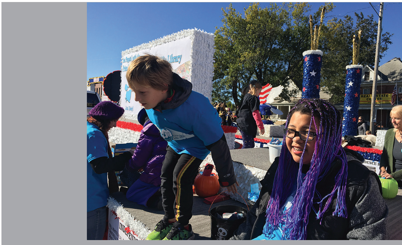
Friends of Independence Library decorated this float for the fall festival parade.